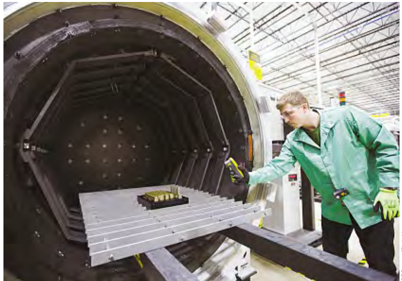
White heat of technology: a CATA employee checks the temperature of components leaving the oven